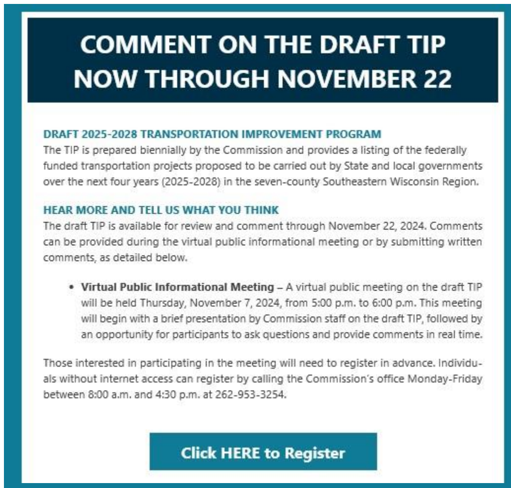
Figure J.1 (Continued)