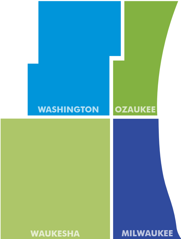
Map 1 Milwaukee Metro Area

In most cases, the data presented in the metro area comparisons pertain to entire metro areas as delineated by the U.S. Office of Management and Budget in March 2020. Some datasets pertain to the largest urbanized area within the metro areas.