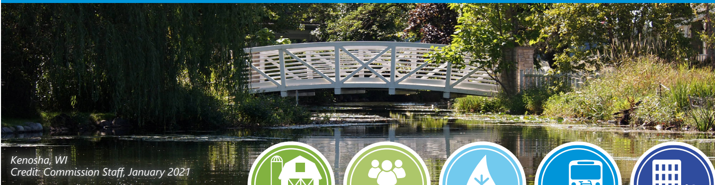
Kenosha, WI

A publication of the Southeastern Wisconsin Regional Planning Commission